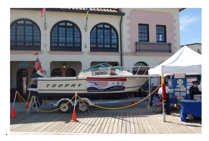
Flotilla 81 Operational Facility on Ocean City Boardwalk for 2015 NSBW.