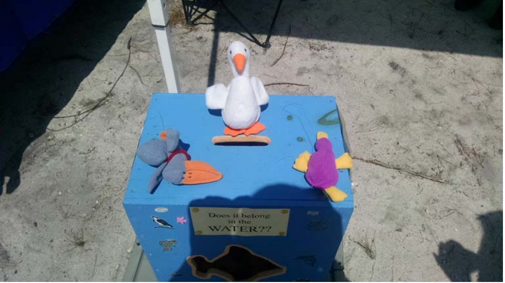
Display to teach youngsters about trash in the water

May 13, 2015- An event attended by one Flotilla 7-11 member along with a member of Division 18 at the Hooked on Fishing Not Drugs 4H club in Leesburg, NJ. The event was also attended by 2 members of Station Fortescue. There was talking with the children about marine safety, what the USCG is and what the Aux is, why to wear life jackets, how to fit a life jacket, and how to call for help on channel 16 among other topics. May 17- Cedar Creek Marina. Three Flotilla 7-11 members did a VSC day with 6 checks and a MS booth. May 16-17, 22-23- Marine Patrols were conducted by flotilla members. May 20- PATONs were verified by a flotilla member working with ANT Cape May. Two members worked as watch standers at Station Barnegat and Sector. Throughout the week there was two more VSC's conducted and there was 42 program visits, distributing information about the new mobile app and AWW. May 25- There was an event at Beachwood Day, in Beachwood NJ. There was 5 members in attendance. There was a table set up along with a marine safety display. The flotilla worked with Aux recruiting, marine safety, talking about VSCs and Americas Waterway Watch.