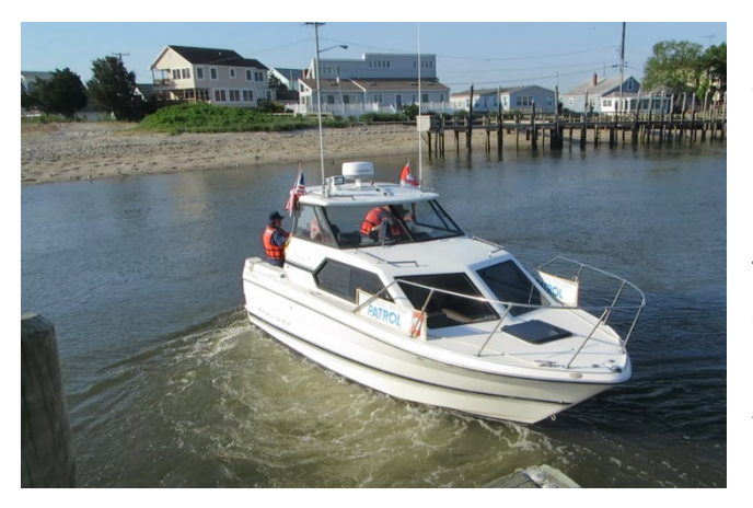
A U.S. Coast Guard Auxiliary patrol leaves Bowers Beach on Memorial Day to assist boaters on the Lower Delaware Bay.

Bowers Beach, DE –Traditionally, Memorial Day is not only a time of remembrance, but it also marks the start of recreational boating season. This year it marked the start of U.S. Coast Guard Auxiliary safety patrols on the Delaware Bay. While many of us take to the water for recreation, others depend on the water for their livelihood. The selfless men and women who make up the crews on U.S. Coast Guard Auxiliary safety patrols take to the water to save lives.